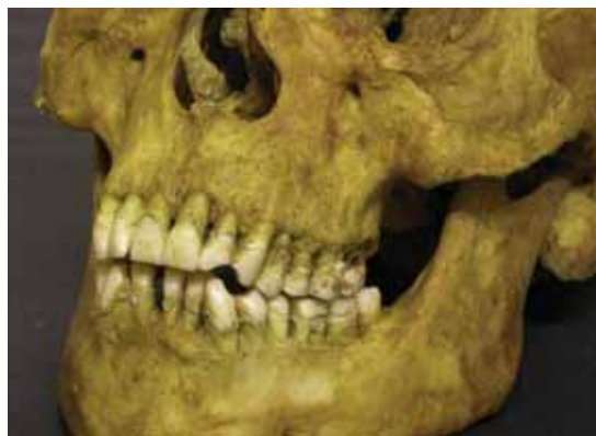
Fig 1 Individual [1099] with 'pipe facet' from Sts Mary and Michael

Dentitions were present in 92.5% (248/268) of adults from St Mary and St Michael. Fifty-eight of these (248: 23.4%) displayed occlusal wear patterns characteristic of the habitual use of a clay pipe. In many cases, a clear circular 'hole' was evident when the upper and lower jaws were closed (Fig 1). Males were affected more frequently than females to a statistically significant extent.