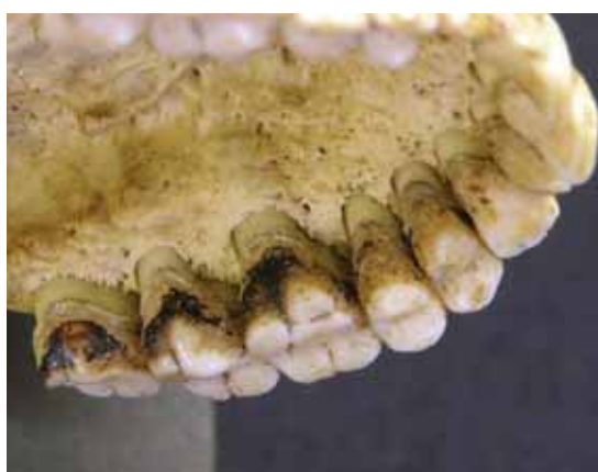
Fig 2 Individual [1051] with dental (lingual) staining from Sts Mary and Michael

Brown staining on the lingual surfaces of teeth (Fig 2) was also more common in males. Staining was found in significantly more adults with pipe facets (32/58: 55.2%) than those without (8/190: 4.2%) ( \chi^2 = 85.31 , df = 1 , p \leq 0.0001 ) (Table 1). No subadults were affected.