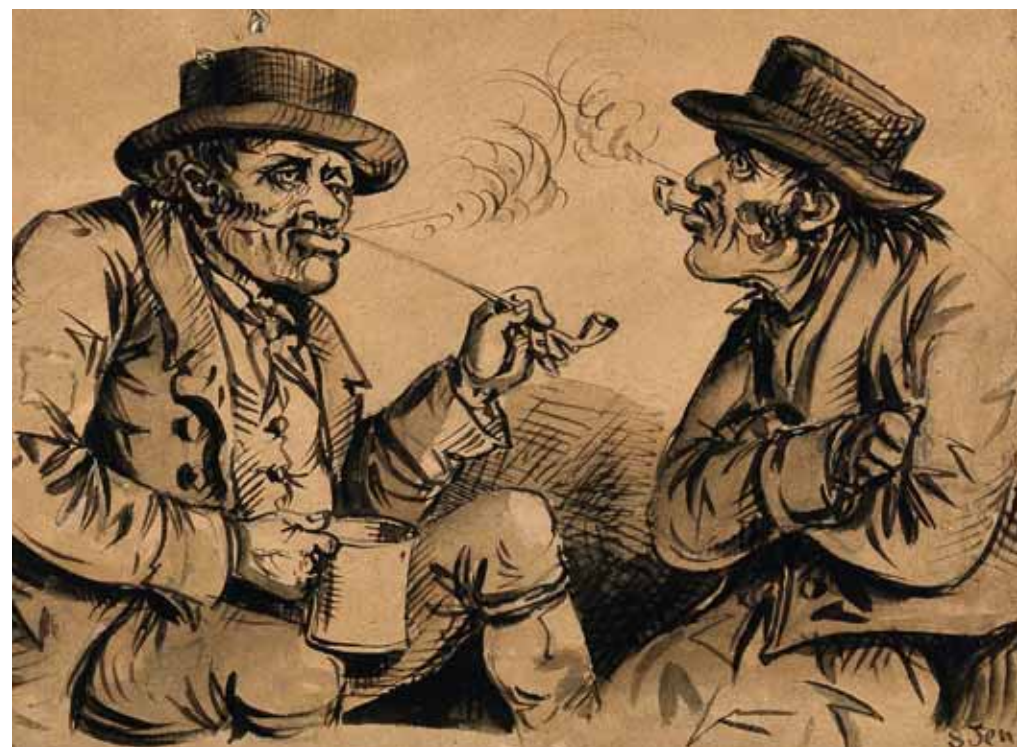
Fig 4 Ink drawing by S. Jenner 1850. Two men smoking pipes.

Such evidence of tobacco use may prove a rich source of further research. While social status may have been important in determining the levels of smoking within the population, cultural factors such as gender were just as critical (Fig 4). Many males smoked, most females did not.